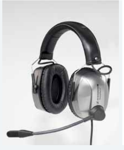
Sennheiser-Headset HMEC 460