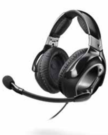
Sennheiser-Headset S1 Digital