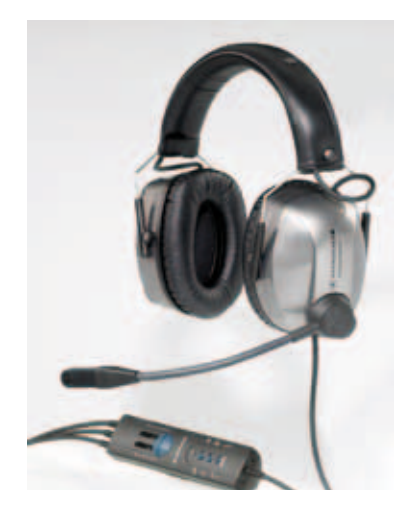
Sennheiser-Headset HMEC 460