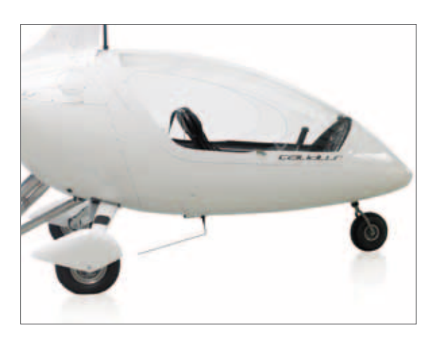
Open canopy without sunroof