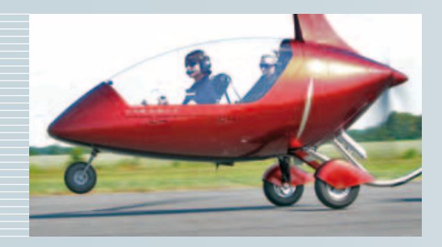
Ready for take off

sumption and wind noise is massively decreased. Each Calidus is handmade and completely customized in AutoGyro's serial production factory, respecting the strictest quality requirements. Combined with the most modern avionics technology each gyroplane offers a 100% safe, fun and fascinating flight experience, 365 days a year.