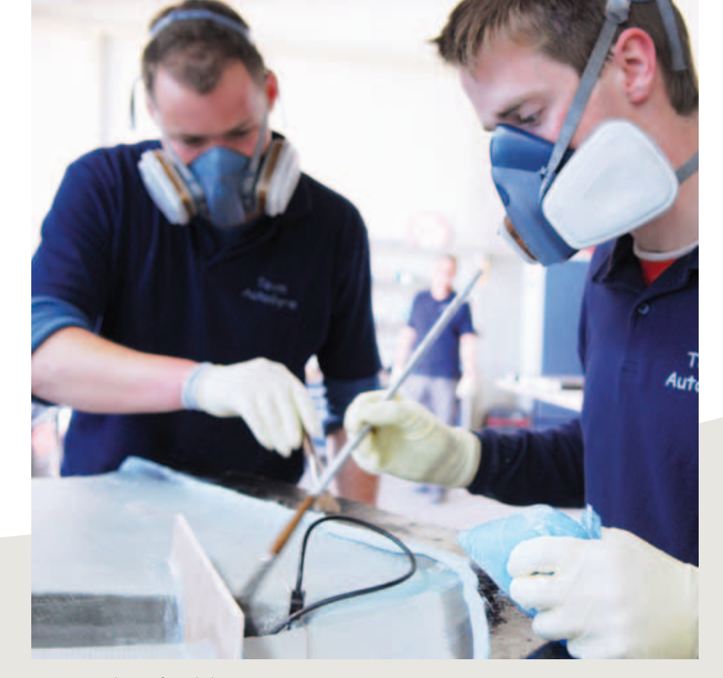
Laminating the reinforced plastic parts