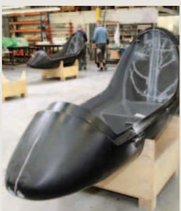
Ready laminated and cured monocoque