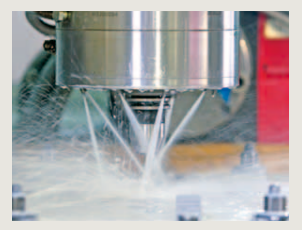
High-precision manufacture with modern CNC machines