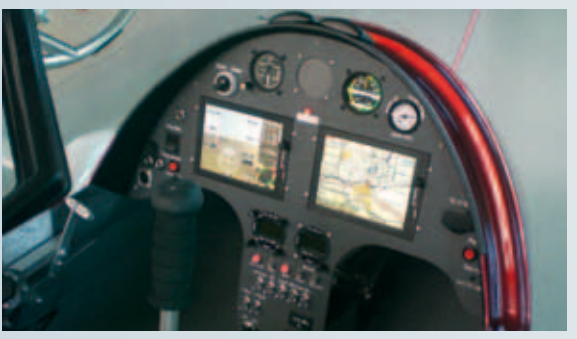
Each cockpit will be equipped individually