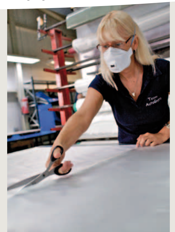
Tailoring the glass and carbon fibre

finished monocoque of the Calidus is prepared and painted in our in-house paint shop. No matter what choice of finish the customer wishes—single color, two-coloured, flip flop or even gold foil — we will do everything possible to create it.