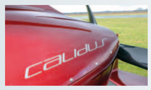
The Calidus – that's quality, comfort and fun