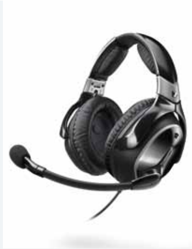
Sennheiser-Headset S1 Digital