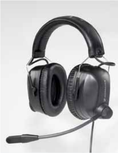
Sennheiser-Headset HME 110