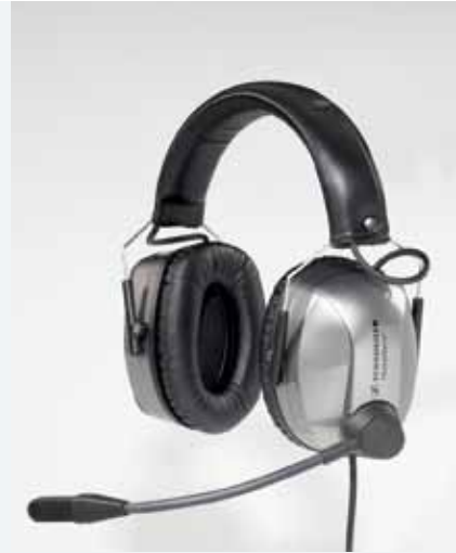
Sennheiser-Headset HMEC 460